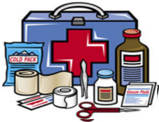
Medicaid needs First –Aid

DSS is struggling to keep pace with the volume of work assigned to the adult Medicaid unit. As of August 2008, there are 1010 active Medicaid cases divided among 3.5 workers (roughly 288 cases per worker not including changes and new applications). This is the only area to which we are experiencing a