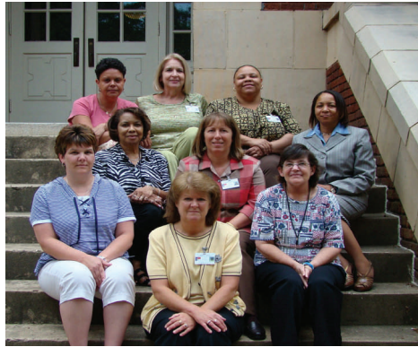
DSS Food & Nutrition Department

Did you know... that the food stamp program started out as a department of agriculture program instead of a social services program. Food stamps derived from the surplus goods of farmers that the government purchased to assure that the farming industry remained stable.