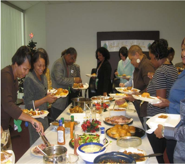
Angel Tree Celebration