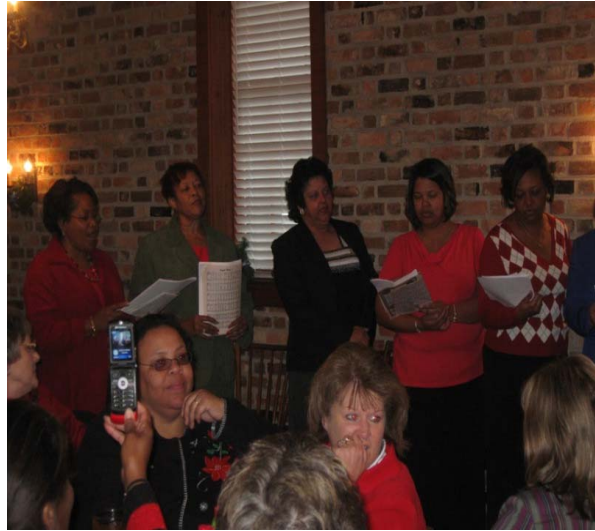
Christmas Party Celebration