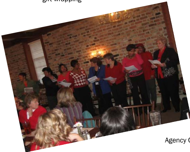
Agency Christmas Party