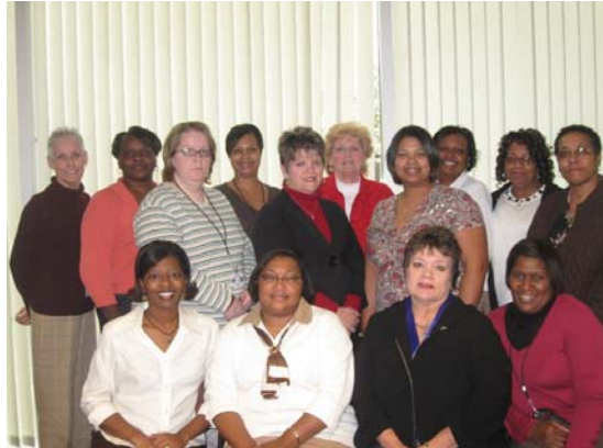
Work First & Work First Family Assistance Team