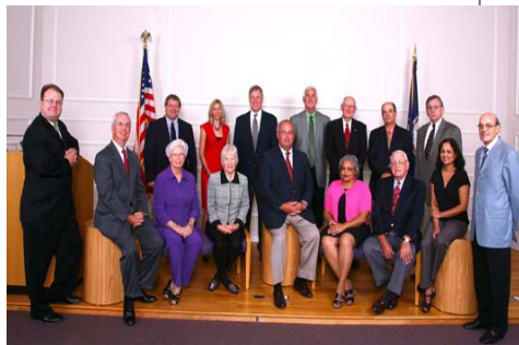
Board of Directors Community Memorial Healthcenter South Hill, Virginia

eral families. We acknowledge Jordan Chapel, Spring Green Baptist, Cooks Chapel Baptist, Greater Lovely Hill Baptist, First Baptist Church, Community Memorial Healthcenter (Va.), and all the private donors for their support. We continue to accept contributions/donations throughout the year. You can give by contacting 252-257-5000.