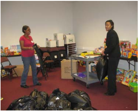
Toys For Tots "gift wrapping"