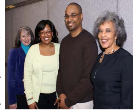
UNC School of Social Work

Distance Learning Advisory Board and a partner with the Child Welfare Collaborative & Field Education office.