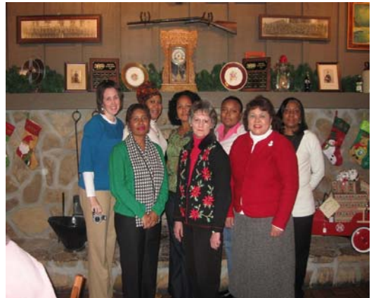
"we know the reason for the season"